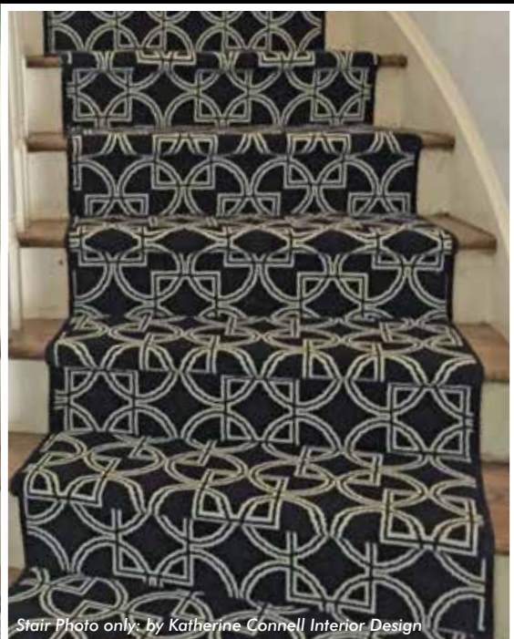
Stair Photo only: by Katherine Connell Interior Design